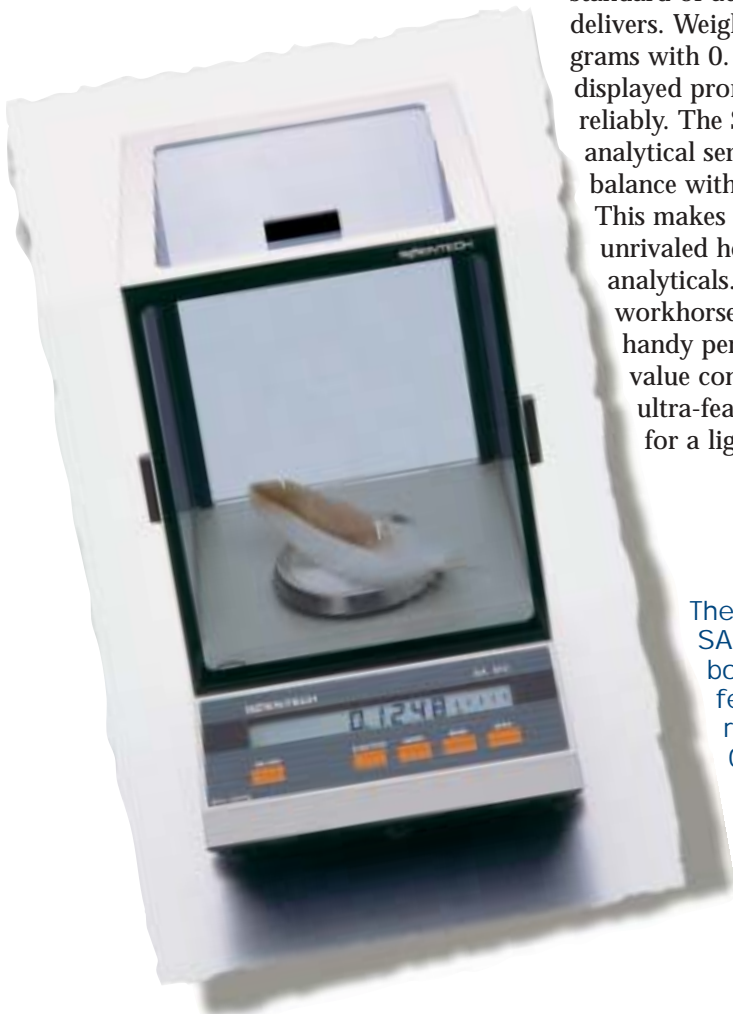
The heavyweight SA 510 (510g) boasts an ultra-featherweight readability of 0.1mg.

The SG Series is a high capacity family of balances sporting flat, rectangular pans as standard equipment. Easily handling up to 12,000 grams with a feather touch of 0.1g, this species is an accurate, feature-rich line perfect for any high capacity application.