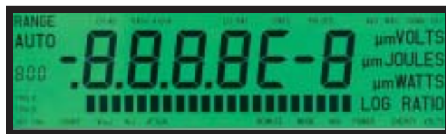
FULL DISPLAY OF D200

All D200 dual channel ratiometers display measurements of channel A or B or the ratio of measurements of A/B or B/A. In addition, you may select either linear or log units of measure at the push of a button (ratio mode only). With the D200P and D200PC, you can calibrate pyroelectric detectors using the optical transfer calibration mode with a laser, a calibration transfer standard, and a beam splitter. This procedure yields a power calibration standard which you then enter manually. Each meter has a large dynamic graphical tuning bar which immediately depicts any measured change in power which is ideal for laser tuning.