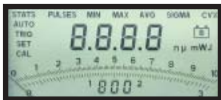
FULL DISPLAY OF H410

Although the H410 is a hand-held device, it includes the same robust statistics mode as the S310. Perfect as a field service unit and as a laboratory standard, this small meter utilizes Ni-Cad rechargeable batteries and comes with a battery charger. A low battery annunciator will appear in the display when recharging is necessary. A protective soft case is also included as standard equipment. Available optional accessories include a laboratory stand for lab use and a small carrying case which will embrace two sensors, the H410, cables, charger, base, and extra batteries.