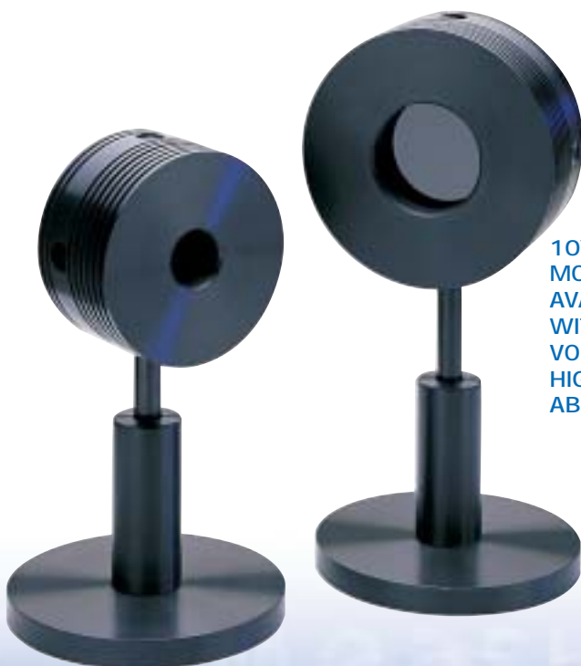
10W AND 30W MODELS AVAILABLE WITH SURFACE, VOLUME AND HIGH DAMAGE ABSORBERS