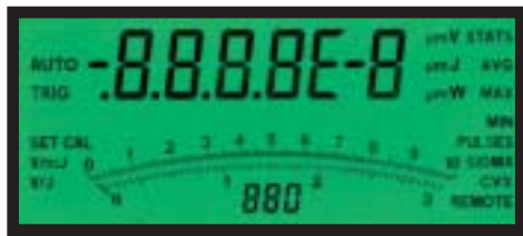
FULL DISPLAY OF S310

Multipliers as fine as 0.0001 and as large as 9999 can be entered into memory and then applied to the reading in order to yield a converted displayed value. This is particularly useful when using beam attenuators. Another commanding trait is the group configuration feature. This handy tool gives you the ability to save four different detector settings into the S310's internal memory. Each detector setup includes indicator configurations and communication options desired for different detector operations. Any of the four setups can be recalled at the touch of a button, making detector changeovers a snap.