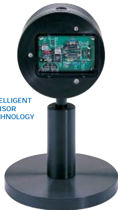
INTELLIGENT SENSOR TECHNOLOGY